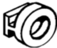
M - 226 SNAP ON CARRIER