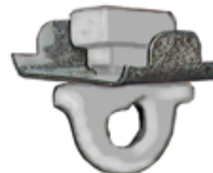
M-120 LOCKING TWIST STOP