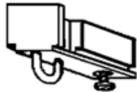
M - 115 END STOP WITH LOOP