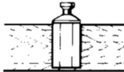
M - 113 SEW ON TAPE