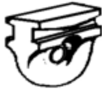
M - 111 EYELET CARRIER

Best suited for Bunk or Porthole Curtains. Designed for top, or vertical mounting.