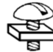
M - 114 SCREW STOP