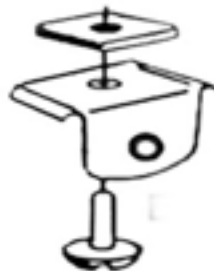
# 9684 End Stop Metal