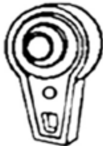
# 9670 Roller Slide