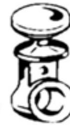
# 93121 Nylon Snap Slide