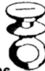
# 9406 Nylon Slide