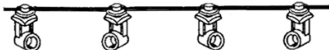
# 92141 Ripplefold Snap Carrier (SNAPS 4 1/4" ON CENTER)