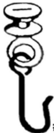
# 9685 Nylon Slide w/Hook

This track can be used where extra strength and durability are required.