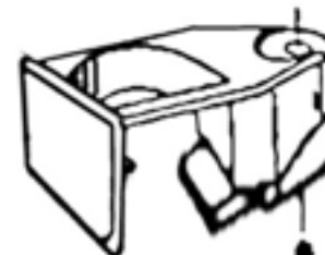
# 94142 End Cap Plastic